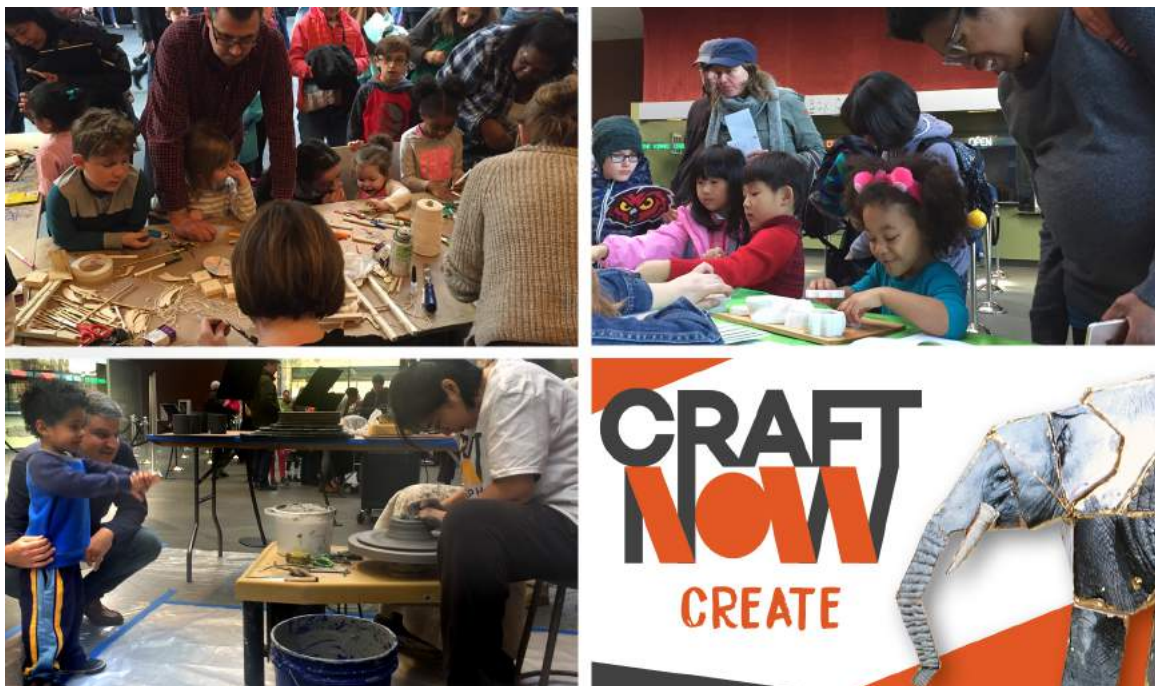
Top Left: CraftNOW Create Wooden Toy Making presented by Wharton Esherick