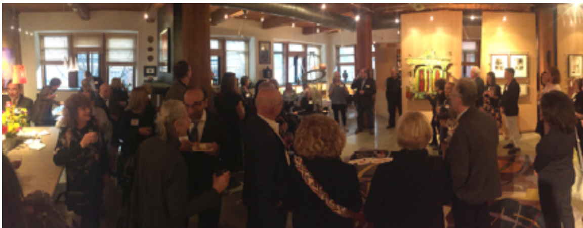
On April 6, 2018, guests were given the unique opportunity to preview three of Philadelphia's most exciting contemporary craft collections.