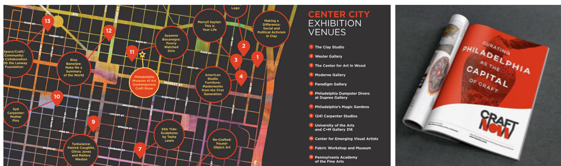
Left: A more detailed view of the map included in our brochure can be viewed in Appendix A of this report Right: Collaborating with En Route and Masters Group Design, CraftNOW produced striking and colorful full-page advertisements in America Craft Magazine

As part of a sponsorship from the American Craft Council, CraftNOW was given three full-page advertisements in their publication America Craft Magazine that is distributed to over 100,000 readers well-versed in craft and its scholarship. In total, CraftNOW generated cross-promotional opportunities for partner organizations while elevating the brand of CraftNOW to a more national audience.