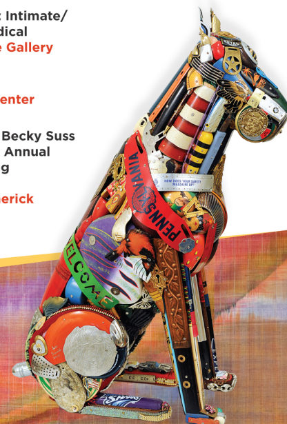
(Below) Leo Sewell, Boxer , assemblage. On exhibit with the Philadelphia Dumpster Divers at Dupree Gallery in Re-Crafted: Found-Object Art

Details at craftnowphila.org/exhibitions